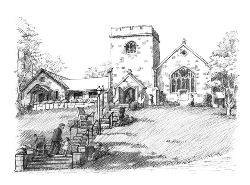
The Episcopal Parish of ST. JOHN THE EVANGELIST Hingham, Massachusetts