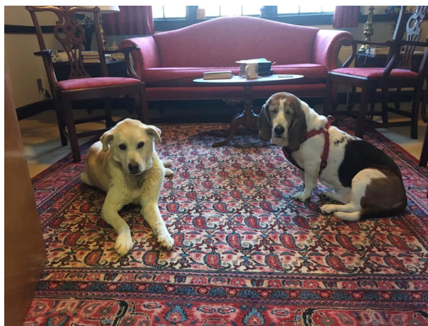
Clergy dogs Delilah and Flo

On Sunday, September 29, all creatures great and small are invited to a Community Pet Blessing, hosted by St. John's. This brief service will take place at 5:00 pm. In addition to live animals, children are welcome to bring their favorite stuffed animals to be blessed. This year we're again partnering with the South Shore Pet Food Pantry and you're encouraged to bring donations of dog and cat food, pet toys, kitty litter, and leashes.