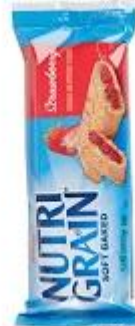
Nutrigrain bars (any flavor)