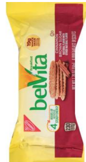
Belvita cookie snack packs (any flavor)