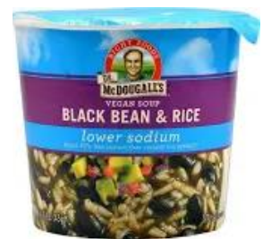
Any of the McDougalls vegan soups

Please note: we use vegan products to help streamline our menu for children with food allergies (lactose intolerance, egg allergies, etc.) and the check mark indicates most needed products.