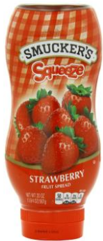
✓ Strawberry or Grape Smucker's Jelly Squeeze

Weymouth Food Pantry runs a 'Weekend Back Pack Program' together with Weymouth Public Schools. The program was started to meet the needs of children who relied on food assistance programs at school to meet their nutritional needs, but experienced food insecurity on weekends. This year, because most of our children are fully remote, the need is greater than it is have been. We have adjusted the menu to include larger servings, and will be sending home enough food for a whole week. We are deeply appreciative of your help and support of this program. Thank you.