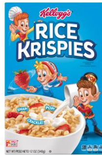
12 oz Kellogg's Rice Krispies