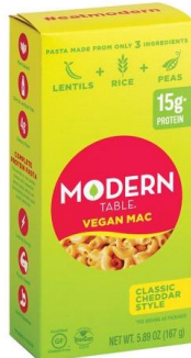
5.89oz Vegan Mac n Cheese (any brand)