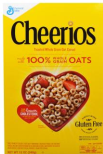
✓ 12oz Cheerios Whole Grain Oats